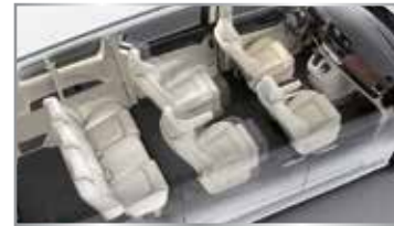
Full rail, forward and backward adjustment