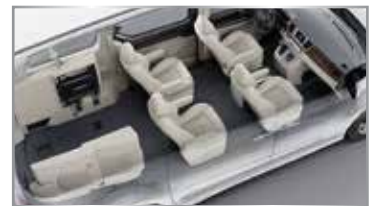
the seat of the third row can be flipped to the side