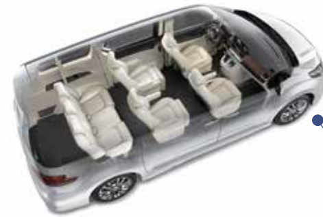
7 seat seating cabin design