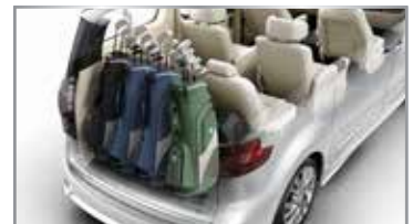
Maximum luggage space can reach 2500L