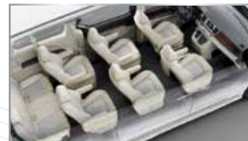
9-seat cabin design