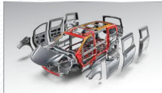
Integrated body, Layer Build double layer welding technology, making passive safety stronger.