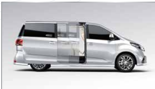
Smart anti-squeeze automatic sliding door system on both sides makes stepping in and out more convenient and safe.