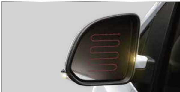
Smart lane-switching reminder to give pre-warning on the risk of lane-switching and to avoid blind spots during driving.