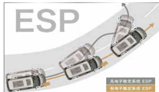
Latest generation of Bosch ESP9.1 electronic stabilization assistance system to provide full control on safety.