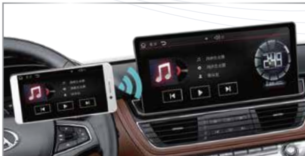
Car-link human-computer smart interaction system can synchronize mobile phone and big screen, realizing convenient interactive touch control.

The brand new SAIC MAXUS G10 integrates cutting-edge technology to provide you with more human-oriented configurations. Be it the Car-Link human-vehicle smart interaction system, the touch-free smart sensing rear door, or the smart anti-squeeze automatic sliding doors on both sides are all in place to create a more convenient experience for you. At the same time, the brand new G10 provides a comprehensive safety protection with EURO 5 star safety standards. Adopting the new generation Bosch ESP9.1 electronic stabilization assistance system, it is proactive in safety guarantee, which gives you full control of success in stable and steady manner. The world's leading Layer build double welding technology gives you more than 50% of super high intensity and high intensity steel utilization rate, a passive safety shield that gives you reliability way above same grade vehicle and allows you to drive carefree.