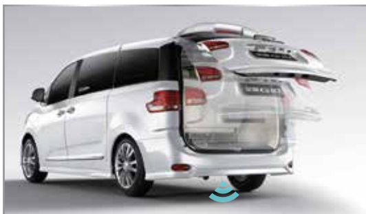
Touch-free smart sensing rear door to thoroughly free up your hands.