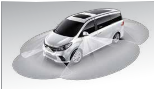
360-degree panorama video coverage to eliminate blind spot and make driving safer.