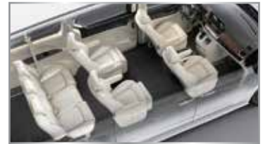
Maximum distance between the two rows is 1400mm