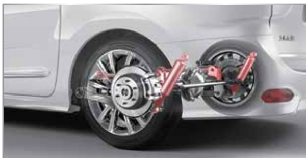
Nivomat fully automatic driving control system, combining comfort, trafficability and manipulation.