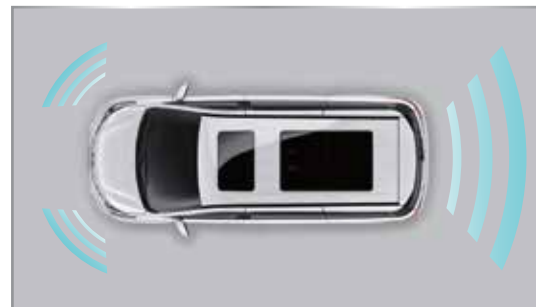
Comprehensive parking assistance system with complete guarantee to free your worries.