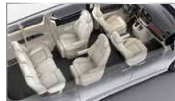
rotating seat for convenient communication