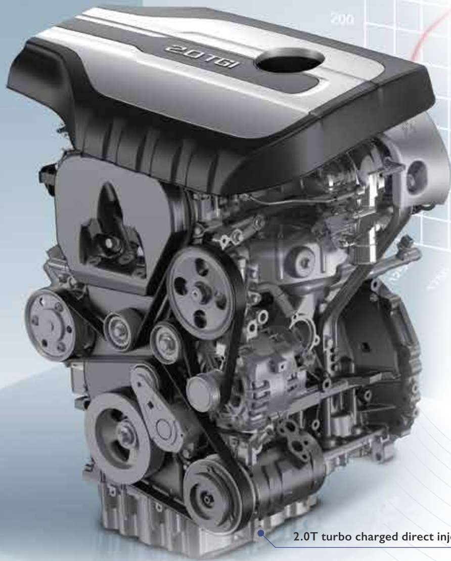
2.0T turbo charged direct inject engine